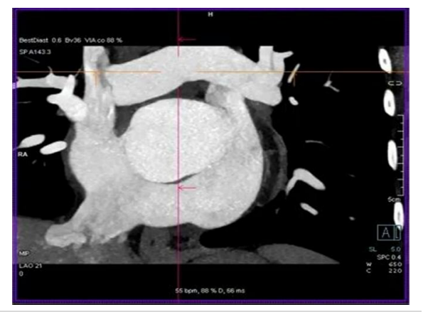
Fig. 6. Cardiac computed tomography showing congenital heart defect in form of PLSVC, into which left superior pulmonary vein drains, with rightward displacement of atrial septum.

During the second hospitalization in November 2023 for the purpose of undergoing CVE, the procedure was abandoned in favor of pharmacological cardioversion with restoration of sinus rhythm, which was performed without complications. After echocardiography, which showed no changes compared to the previous one, the patient underwent cardiac surgery consultation and was qualified for surgical correction of the congenital defect.