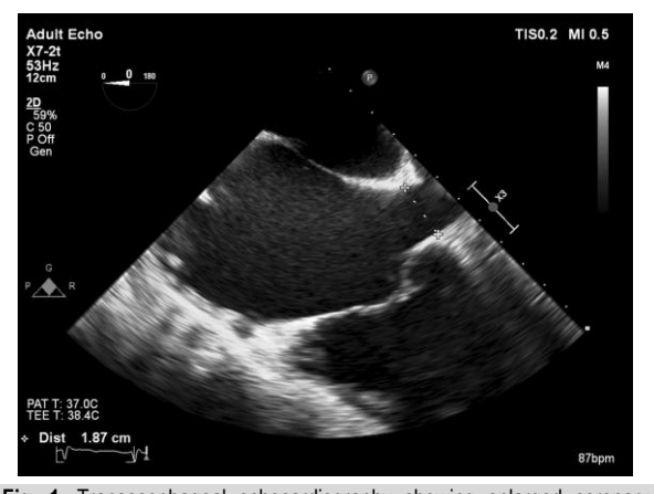
Fig. 1. Transesophageal echocardiography showing enlarged coronary sinus – 32 \times 19 mm.