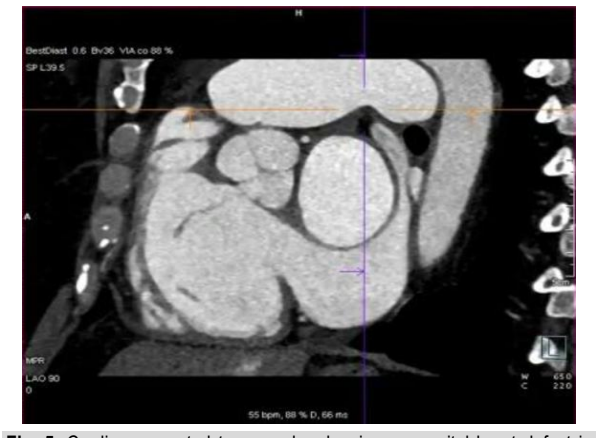
Fig. 5. Cardiac computed tomography showing congenital heart defect in form of PLSVC.