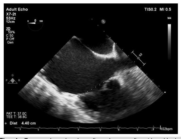
Fig. 4. Transesophageal echocardiography revealing tricuspid ring measuring 44 mm.

On the 27th of June 2023 the patient underwent a planned circumferential ablation of the pulmonary veins, achieving their electrical isolation. Using a transseptal approach, a mapping electrode (Lasso) and an ablation electrode (SmartTouch) were introduced into the left atrium. Mapping was performed using the CARTO 3 electroanatomical system. It showed the presence of the left common pulmonary vein. Then the procedure was extended to include an ablation line on the roof and posterior wall, creating BOX, and an oblique line on the anterior wall from the mitral annulus to the right pulmonary veins. During the procedure, pharmacological cardioversion was performed using 300 mg of antazoline and 600 mg of amiodarone, which was unsuccessful.